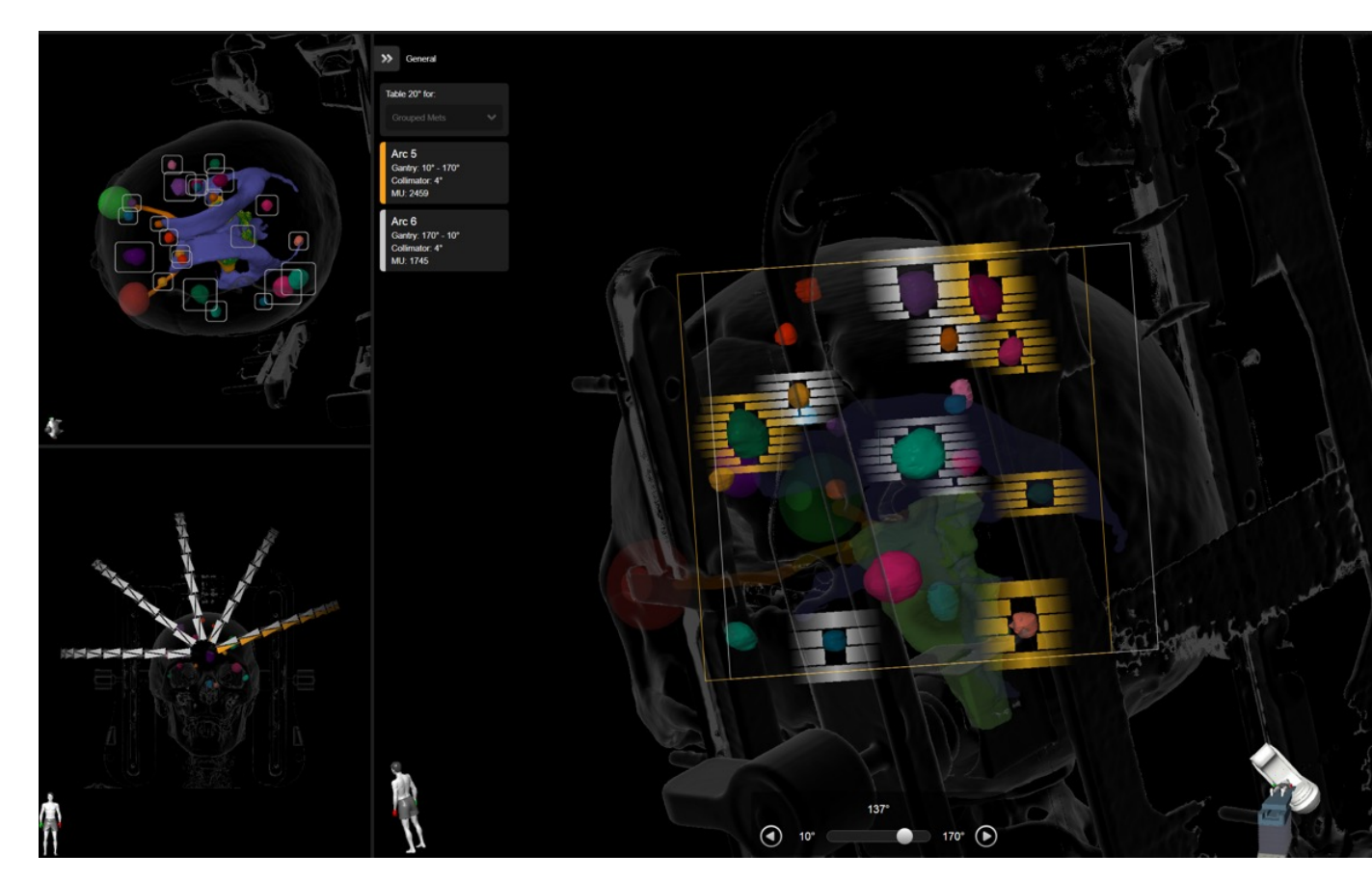
Figure 1. BrainLab Elements MultiMets software for planning single isocenter multiple metastases Stereotactic Radiosurgery